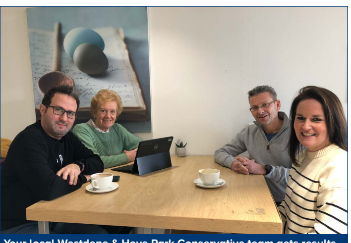
Your local Westdene & Hove Park Conservative team gets results for residents and stands up for the area on the City Council without fail.

We are on call day and night for residents in Westdene & Hove Park ward and ask for your support on Thursday 4 May to be your voice on the City Council.